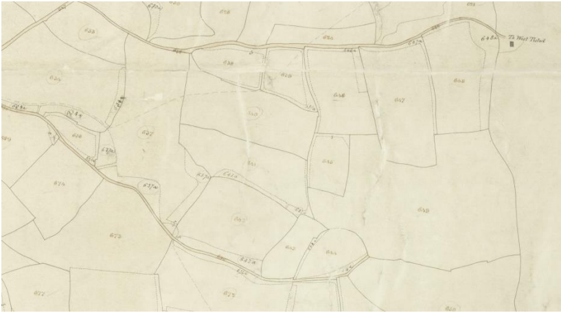
1839 Tithe Map showing Webb Lane