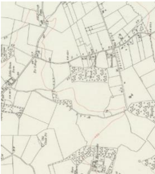
1910 Ordnance Survey showing the new Parkstone Road linking to Webb Lane